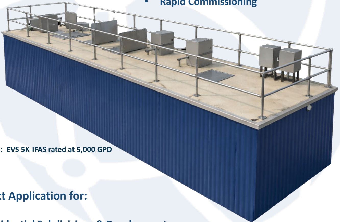
Image: EVS 5K-IFAS rated at 5,000 GPD