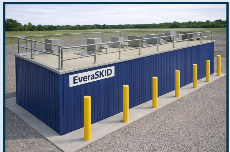
Images Above: EVS 7.5K-IFAS