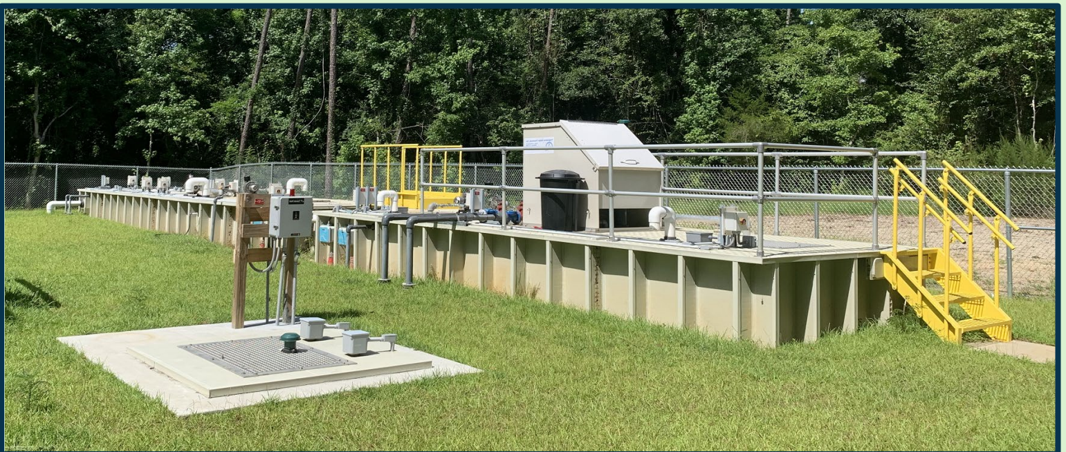
Images Above: EVT MEGA 30K-IFAS installed at a High School Campus Facility