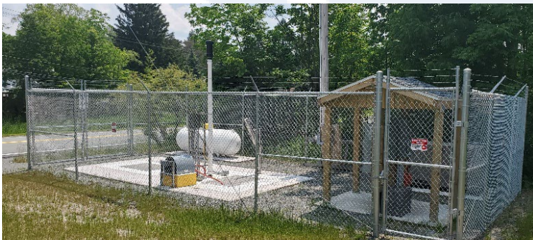
EVF 84-15 Pump Station Facility in Greenfield, PA