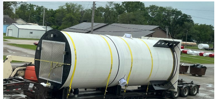
EVF 132-35 package delivery to Crooksville, OH