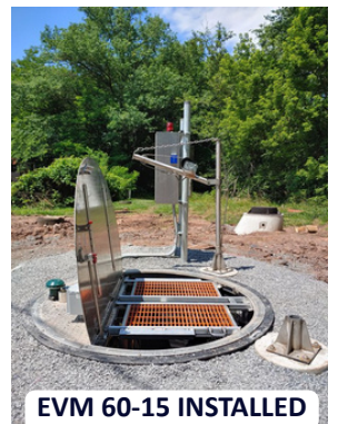
EVM 60-15 INSTALLED