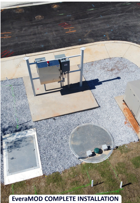
EveraMOD COMPLETE INSTALLATION

EveraMOD™ from INFRASTRUCTURE DYNAMICS is the pre-engineered, factory-direct pump station solution built for commercial projects. Whether you're serving a strip mall, business park, or residential subdivision, we simplify procurement and speed up delivery — without sacrificing customization.