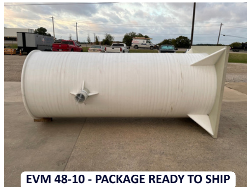
EVM 48-10 - PACKAGE READY TO SHIP

EveraMOD™ from INFRASTRUCTURE DYNAMICS is the pre-engineered, factory-direct pump station solution built for commercial projects. Whether you're serving a strip mall, business park, or residential subdivision, we simplify procurement and speed up delivery — without sacrificing customization.